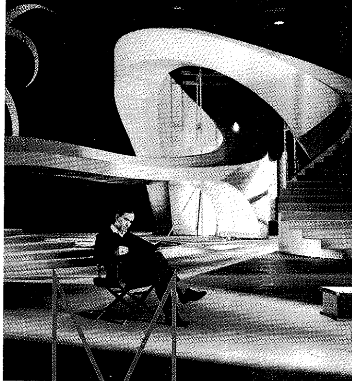
Busby Berkeley in front of one of his sets, 1938, from Los Angeles. Bottom, Audrey Hepburn adorns the Swedish periodical Damernas Värld , 1956.

iddle English rusty? Think the Wife of Bath is a sex worker? Tired of pretending to get Chaucer's bawdy in-jokes? Peter Ackroyd's conversion of The Canterbury Tales (Viking), the classic, salaciously witty pilgrims-on-the-road poem, into Anglo-sexy prose is a romp for the ages.